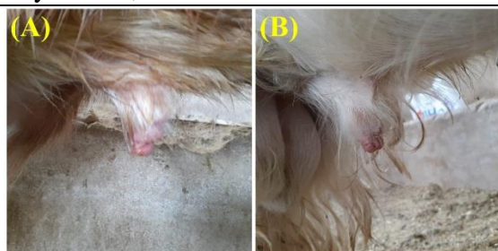
Fig. 2. Epidural analgesia in male goats. Representative images are showing relaxed preputial rings after epidural analgesia (A, B).