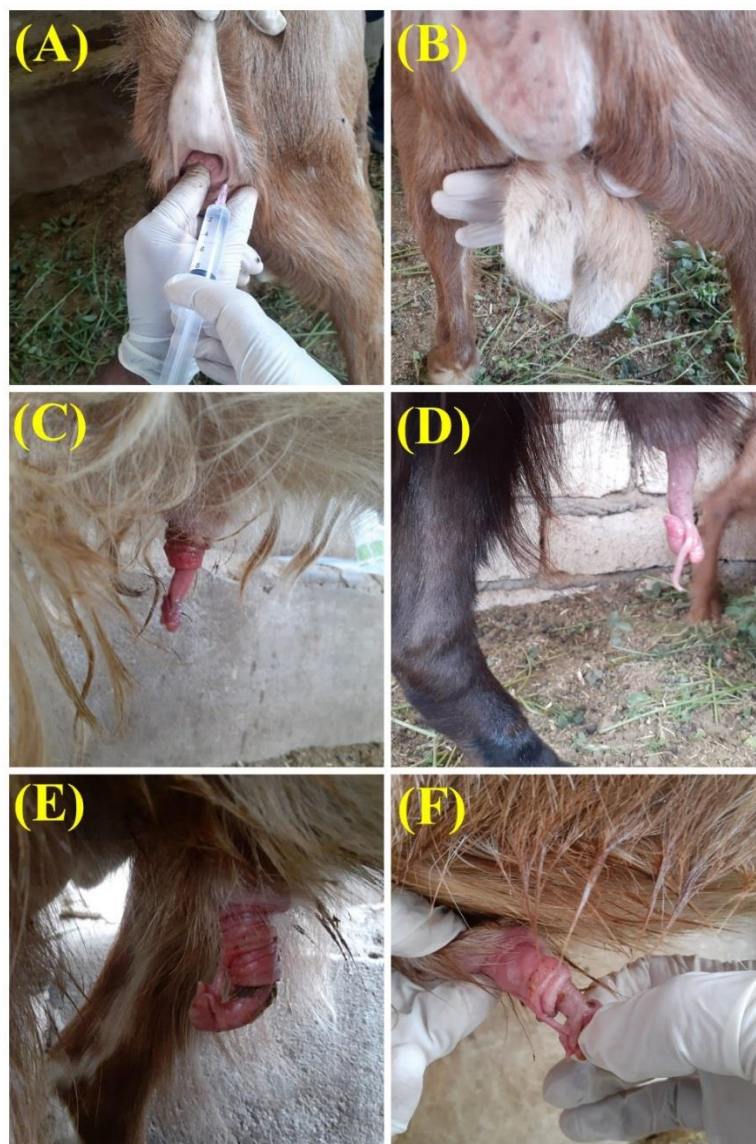
Fig. 1. Pudendal nerve block in male goats. Representative images are showing the ischiorectal fossa approach; where the gloved lubricated left index finger is inserted in the rectum to guide the needle to the slit-like sacrosciatic foramen (A), thorough andrological examination of the desensitized external genitalia (B), completely relaxed and protruded penis (C), completely relaxed penis showing the glans penis and the urethral process (D), and persistent penile frenulum as a congenital male genital system abnormality of the penis and prepuce (E, F).

treated animals showed relaxation and prolapse of the preputial orifice (Fig. 2A, 2B). Motor blockade, incoordination and associated ataxia were observed in all animals with varying degree. Moreover, one treated male goat showed recumbency due to paralysis of the hind limbs after epidural analgesia.