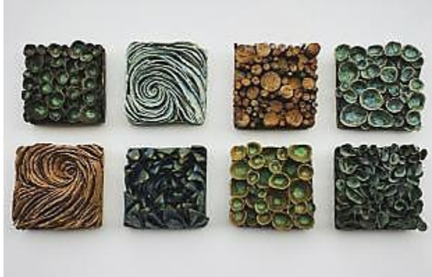
Cube grouping 4.5 × 4.5 × 4"