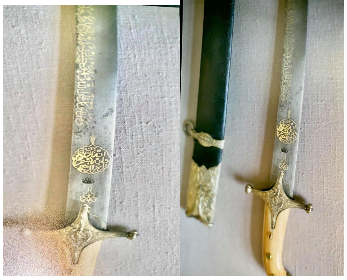
Plate 6 midallion with the Qur'anic inscription (انه من سليمان وانه بسم الله الرحيم)