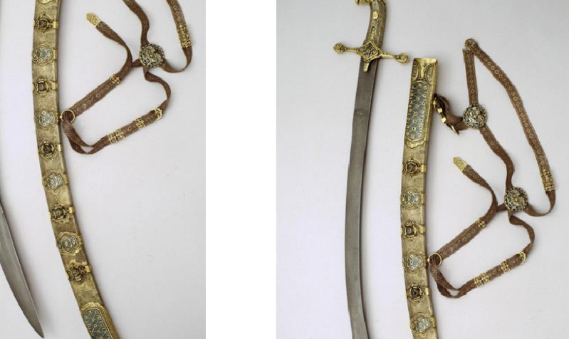
Plate 2 One of the Ottoman Sultan's swords