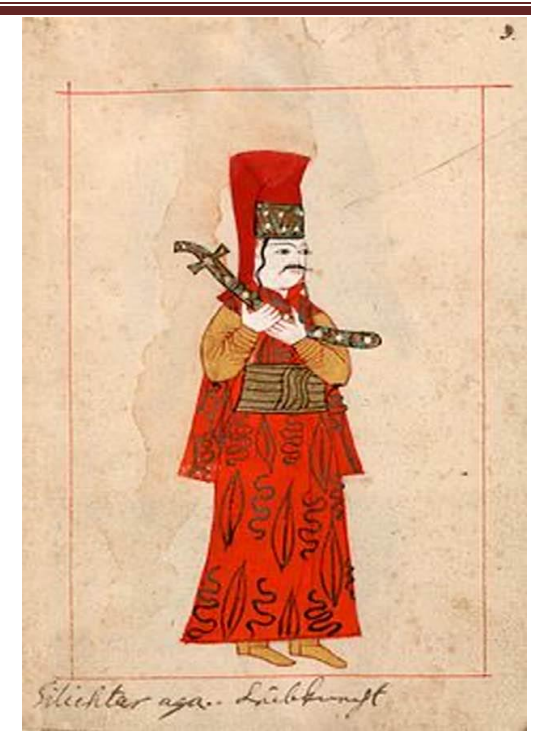
Plate 3 The sword carried by an employee of the Ottoman palace

Plate ,4 , Soldiers of the guard holding their swords behind the Sultan on his throne