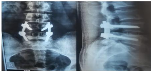
Fig 2: Post op PXR AP & LAT views post operative showing fixation with pedicle screws with interbody fusion by PLIF cage.