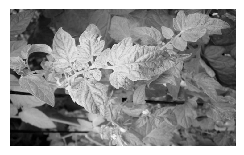
Fig. 1. Tomato spotted wilt virus-induced symptoms in tomato.

caused growth decline especially in the growing tips and the plant became stunted (Fig.1). Green fruits showed dark spots, irregular ripening and reduced fruit set.