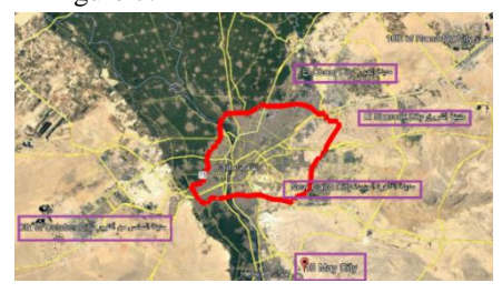
Fig. 7: clarifies the cities that have expanded around the road [14].

Connecting the road with highways and axes led to an increase in smooth connection between the various governorates of Egypt (e.g. Suez Road - Ismailia Road...). As shown in figure No. (5). The connection between Cairo and the new cities (Al-Obour – 6th of October - New Cairo - Al-Shorouk) helped reduce travel time, and thus encourage investments and development of those cities and other new urban areas at that time, as shown in figure 7.