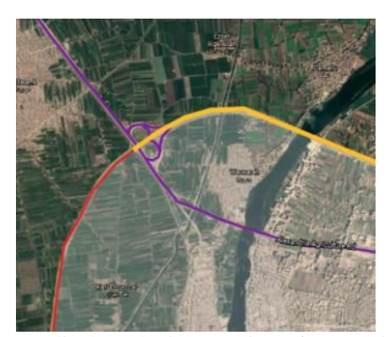
Fig 16: displays the intersection of RRR with the Cairo-Alexandria agricultural road [14]

With the construction of the intersection of RRR with the Cairo-Alexandria Agricultural Road – Banha Road, with a length of 540 m and a width of 42 m, the two roads were fully connected, accordingly, the problem of traffic congestion in this area was solved [32]. As shown in figure 16.