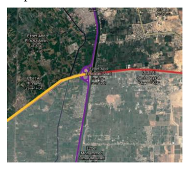
Fig 17: Displays the intersection of RRR with Ismailia-Agricultural Road [14]

The construction of the intersection between RRR and the Ismailia Agricultural Road, as shown in figure 17, helped achieve more accessibility and solved traffic problems in those areas.