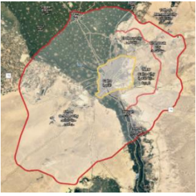
Fig. 6: Displays the middle ring road and the RRR surrounding the primary ring road around GCR [14].

The road was built in order to direct traffic outside the GCR without penetrating the urban block, which helped reduce traffic congestion in the region, consolidate the urban structure of Cairo, and limit random urban growth. The Ring Road is surrounded by the Middle Ring Road and the Regional Ring Road (RRR). As shown in figure 6.