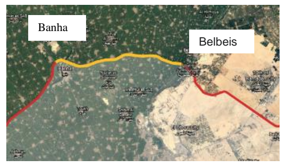
Fig 15: shows the northeastern arc of RRR [14].

It extends from the city of Belbeis in the Sharqia Governorate to the intersection with the agricultural road (Cairo-Alexandria) in Benha City, as shown in the figure 15. Its length is 34.5 km includes 27 bridges and 26 tunnels [32].