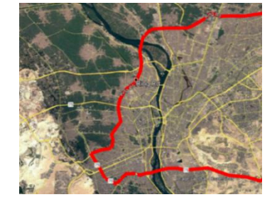
Fig. 8: showing the size of agricultural land in 1984. [14].