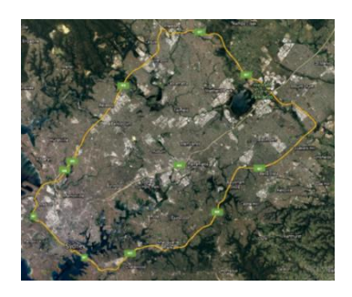
Fig. 4: Route of Sydney's ring road [14].

This road is the first completed ring road in Australia. It was completed in 2007. Its length is 110 km, and it consists of 11 highways that form a circular path, as illustrated in figure 4. It works as a regional road to direct traffic heading from Sydney to outside and connects Sydney's North Airport with the west and south. Furthermore, it connects Sydney to the eastern region, this road was built to increase accessibility, eliminate congestion and traffic problems, and attract other types of development to Sydney [20].