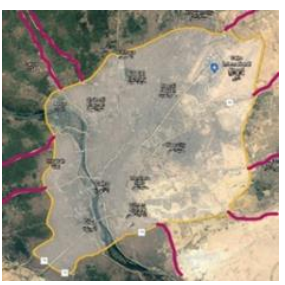
Fig. 5: Displays the ring road around the Greater Cairo Region (GCR) [14].

The road was built in order to direct traffic outside the GCR without penetrating the urban block, which helped reduce traffic congestion in the region, consolidate the urban structure of Cairo, and limit random urban growth. The Ring Road is surrounded by the Middle Ring Road and the Regional Ring Road (RRR). As shown in figure 6.