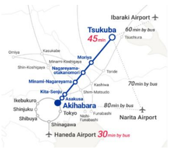
Fig. 1: the Tsukuba Express (TX) railway linking Tsukuba and Akihabara in Tokyo in 45 minutes [11].

Developing road and transport networks. establishing new urban areas equipped with transportation routes, to reduce traffic problems and congestion in central areas. Taking into consideration that providing appropriate means of transportation is one of the factors that attract residents. Notably, some countries (such as Japan) adopted this approach achieve to development. Hence, they established the (Tsukuba Express TX) regional railway, which was inaugurated on August 24, 2005, linking the city of (Tsukuba) with the city of (Akihabara) in the center of the capital (Tokyo) so that you could reach the destination in a time of (45 minutes) instead of (240 minutes) as illustrated in the Figure 1. In addition, the Japanese set conditions to organize the urban expansion.