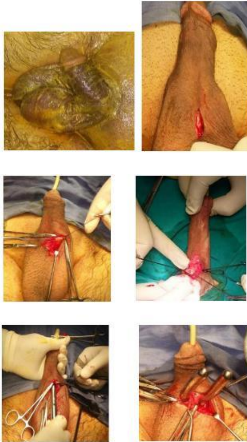
Figure 2: steps of penile prostheses implantation by penoscrotal approach