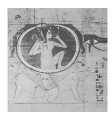
Fig. 6: The ouroboros snake enclosing the solar child between the two horizon lions – Papyrus of Herweben A – 21<sup>st</sup> Dynasty – Egyptian Museum in Cairo SR 19325, TR 14/7/35/6