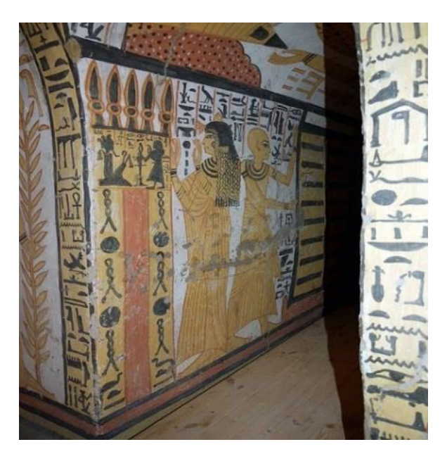
Fig. 3: The northern wall of the corridor that leads to the burial chamber C – Tomb of Nakhtamun, T.T. 335, Deir el Medina

recurring nHH signs set against two D.t signs depicted at the base of each side of the door.<sup>14</sup> Despite the fact that this scene is not accompanied with the annotations of the BD chapter,<sup>15</sup> it is believed to be the vignette of chapter 72 whose title is "Formula for opening the imHt and going out into the day". The imHt is translated as both the tomb chamber or the netherworld,<sup>16</sup> which denotes that both of them are playing the same role. Thus, this door is considered as both that of the tomb and the netherworld which are in fact equated with the door of the sky.