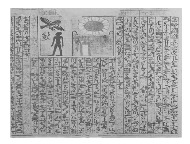
Fig. 1: Vignette of the BD chapter 92, Papyrus of Neferwebenef, Louvre III 92, mid 18<sup>th</sup> Dynasty

for all of them share the same function of providing an exit of the dead from the darkness of the netherworld to his rebirth. This idea was not iconographically proven before the Book of the Dead vignettes as in that of chapter 92 in the papyrus of Neferwebenef (Louvre III 93). The scene shows the deceased's bA and Swt getting out from the tomb whose façade is depicted with its upper part has two bulging ends between which the sun disk shines and emanates its rays so as to resemble the Axt sign of the horizon. These two protruding sides could be equated with the two mountains of the horizon that provide an entrance and exit to the eastern and western horizons of the sky. According to the annotations of the chapter, the tomb is open for the bA and Swt of the dead so as to go out into the day which is reflected in the vignette. The fact that the bA of the dead returns also through the same door suggests that the door of the tomb plays a dual role being an assimilation of both the eastern and the western gates of heaven.