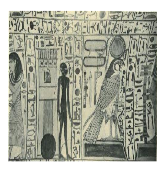
Fig. 2: Vignette of the Book of the Dead chapter 92 – Tomb of Nebmaat, T.T. 219. Deir el Medina

leave the door of the tomb.<sup>13</sup> In this version of the vignette, only the Swt of the dead and the sun god go out in the day to start their diurnal journey. The door of the tomb is topped with a cavetto cornice under which there is a panel decorated with repetitive patterns of nHH signs. Due to the correlation between the nHH signs and the idea of the assimilation between the door of the tomb and the Door of Heaven, the vignette of the BD chapter 92 from the tomb of Nebenmaat refers to the cyclic movement of the sun god, who is identified with nHH , along with the dead in his following between the eastern and the western doors of the horizon.