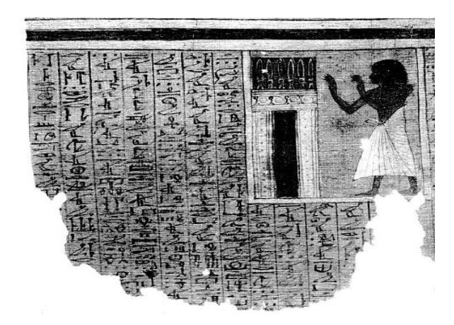
Fig. 4: Papyrus of Neferrenpet, Musées Royaux d'Art et d'Histoire, Bruxelles, E. 5043

The depiction of the nHH pattern is shown on a similar door in the papyrus of Neferrenpet which is decorated with XAkrw motifs on the top followed by repetitive nHH signs below in a horizontal way. The deceased is shown striding towards the door while raising his hands in adoration. This portrayal is the vignette of BD chapter 72 where the nHH signs are also referring to the unending solar cycles around the door that represents the eastern and western horizons. Comparing this vignette with that one in the tomb of Nakhtamun as well as that of BD chapter 92 from the tomb of Nebmaat, the D.t sign is not represented. However, it could be understood that the D.t is replaced in here with the netherworld itself revealed in the form of the interior of the tomb door from which nHH emerges and born.