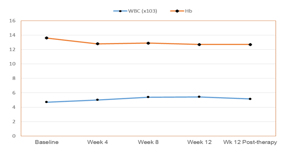
Figure 3. Hematological Changes regarding WBC (x103) & Hemoglobin level (gm/dl) at baseline and follow-up assessments during and 12 weeks post-end of SIM/SOF therapy (N=36)