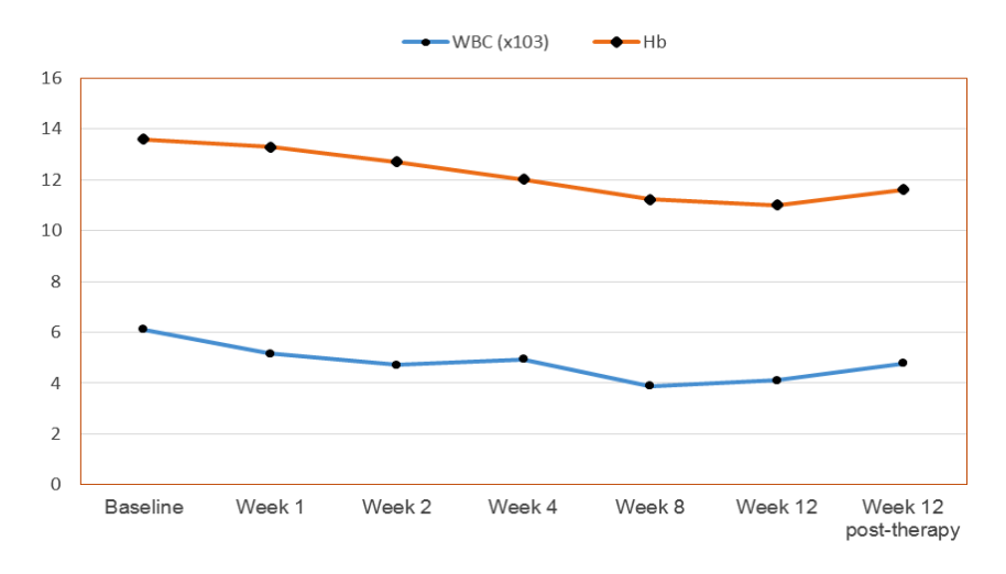
Figure 1. Hematological changes regarding WBC (x103) & Hemoglobin levels (gm/dl) at baseline and follow-up assessments during and 12 weeks post-end of Peg-INF/RIB/ SOF therapy (N=40)

(SOF) Sofosbuvir, (Peg-INF) Pegylated Interferon (RBV) Ribavirin, (SIM) Simeprevir, (ALT) alanine aminotransferase, (AST) aspartate aminotransferase