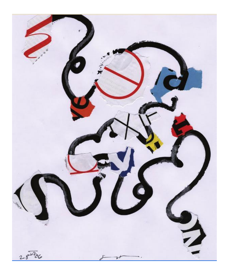
(Helmes, "untitled poem" qtd. in Hill and Vassilakis 26)

Here, it is noticeable that the common definition of visual poetry must be taken into consideration before categorizing each visual poem according to its medium. This medium (usually plastic art form) will define the degree of de- aestheticizing in the poem as it will clarify if this poem is a literary work or not. Artistic explanation can describe this poem as a king of Surrealist piece of art that represents the chaos of society, whereas literary explanation can introduce the poem as an anti-poem that convey the message of Surrealism without using the verbal element.