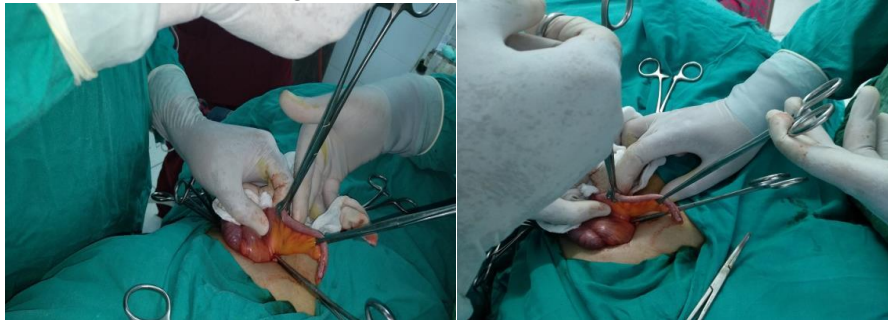
Figure (2): Inflamed appendix in 24 weeks pregnant women.

All the patients involved in the study was subjected to the following: