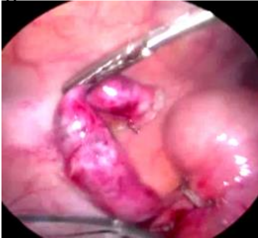
Figure 2: Appendix removed by stapler