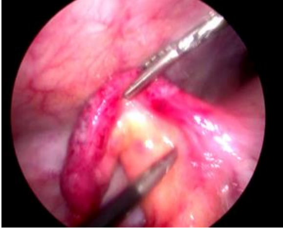
Figure 1: Shows macroscopically inflamed appendix