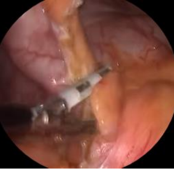
Figure 3: Use of LigaSure to divide the mesoappendix