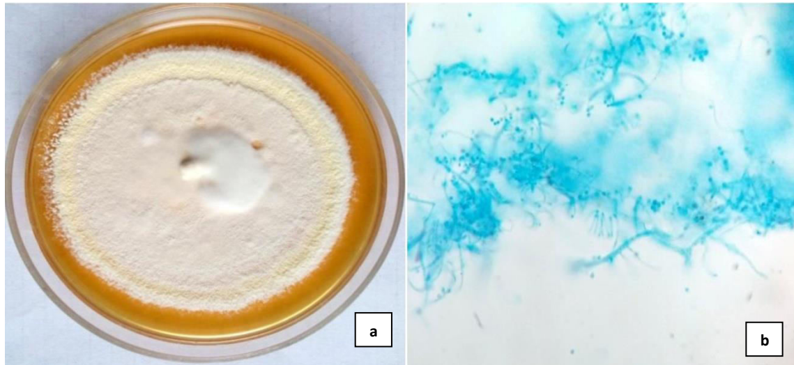
Fig.6a: Growth of Trichophyton mentagrophytes