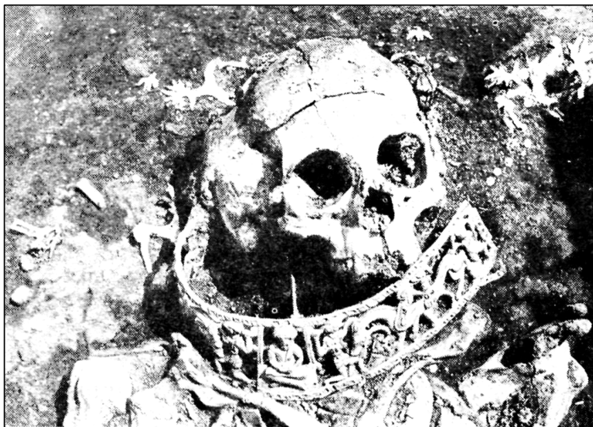
Figure (2) Shows burial in the mound 10, Kobayakov burial ground. (by Guguyev1992).

in the political life of the Bosphorus. Thus, the Sarmatians were one of the important centers of power in the steppe zone of Eastern Europe, which was opposed by the Bosphorus.