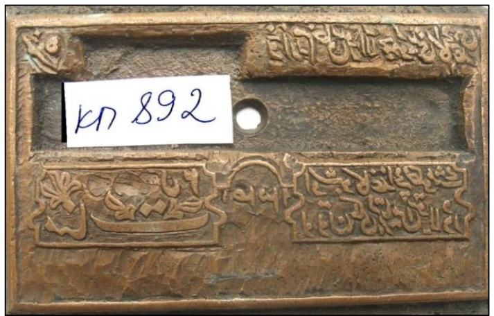
Figure (2) Shows Bronze mold "reverse", denomination: 25manat/rubles dated 1341 AH/1923 AD, preserved at Ichan Qala Museum in Khiva.

several deep areas in the mold that may have been dedicated to a special type of seals used with this mold, as well as an area free of inscriptions at the bottom of the mold.