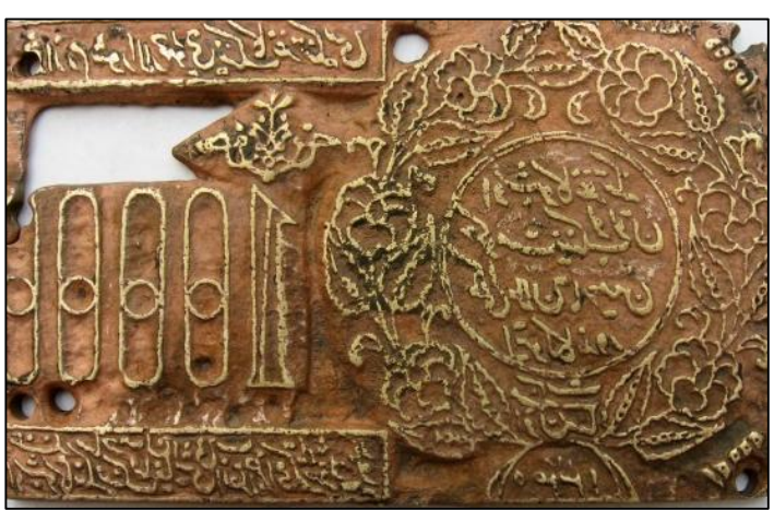
Figure (1) Shows bronze mold "obverse", denomination 10000 manat / rubles, dated 1340 AH / 1922 AD , preserved at Ichan Qala Museum in Khiva.

AH/1922 AD, it can be concluded that it is registered in the same shape on the mold, and also by matching the number of the denomination 10.000 engraved on the sides of the mold it becomes clear that zeros are implemented in the same way as the form of number five but in a smaller size. Concerning the paper money of Khorezm issued in 1341 AH/1923 AD the year Khorezm elimina-ted the silk money and replaced it with paper money, it can be studied through the examination of the similarly-dated metal molds used in printing. The denominations of these molds are as follows: