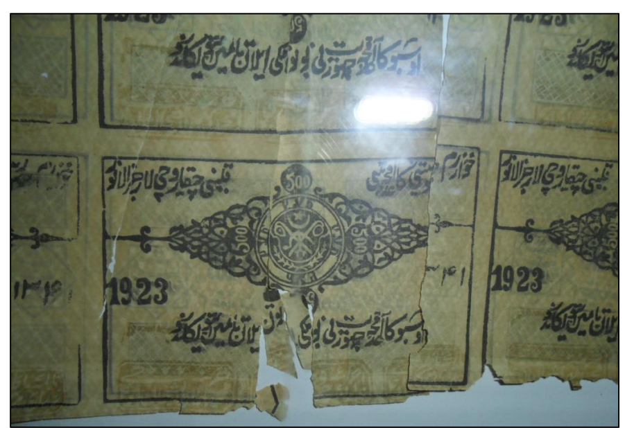
Figure (7) Shows large sheet of paper money, denomination 500 rubles, dated 1341AH / 1923AD, preserved at Ichan Qala Museum in Khiva

other mold and a different color. At other times, the printing is completed in three stages. This process can be recognized in a currency dated 1338 AH/1920 AD, with the denomination 750 rubles, which is distinguished by three different colors, for the frame, the inscriptions, and the design on one side of the banknote. The Ichan Qala museum preserves three templates that were used to print such banknotes. This museum also keeps the remains of a large sheet of with imprints of a 500 rubles mold dated 1341 AH/ 1923 AD, which indicates that the template was applied more than once on a large sheet of paper, then the procedure of cutting starts later, fig. (7). It is observed that the molds under study are more orderly and systematic than the seals and molds used in printing silk currencies.