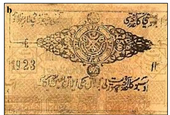
Figure (5) Shows <u>a.</u> Bronze mold (reverse) denomination 500 rubles, dated 1341AH /1923AD, preserved at Ichan Qala Museum in Khiva, <u>b.</u> paper money, denomination 500 rubles, dated 1341AH / 1923AD, <u>www.numismondo.net</u>.