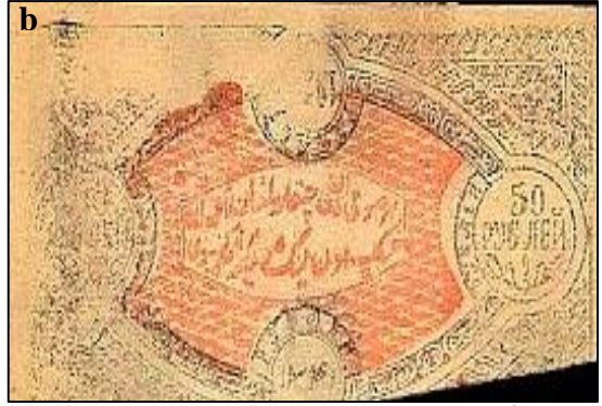
Figure (3) Shows a. Bronze mold "obverse", denomination 50 rubles, dated 1341/1923, Inv. KΠ 891, preserved at Ichan Qala Museum in Khiva, b. paper money, denomination 50 rubles, 1341/1923, www.numismondo.net