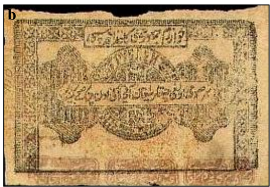
Figure (6) Shows a. bronze mold "reverse", denomination 1000 rubles, dated 1341AH / 1923AD, preserved at Ichan Qala Museum in Khiva, b. paper money, denomination 1000 rubles, www.numismondo.net.