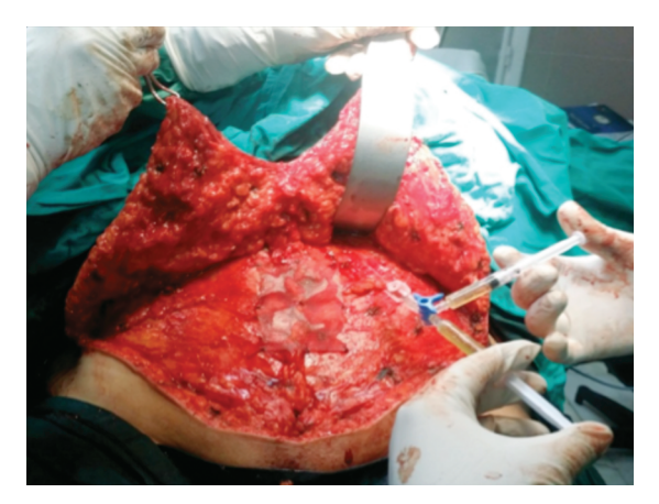
Fig. (1): Spraying the fibrin glue.