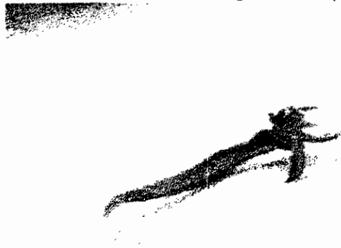
Fig(1) :Direct shoot proliferation from leaf cultured on MS medium supplemented with 1.0 mg/L 2,4-D.

The different responses could be due to the varying concentration of growth regulators used in the medium and explant type (Samantary et al. , 1995). There was certain regulators action of cytokinin, auxin and apical dominance in vitro shoot bud regeneration (Das and Rut,2002).