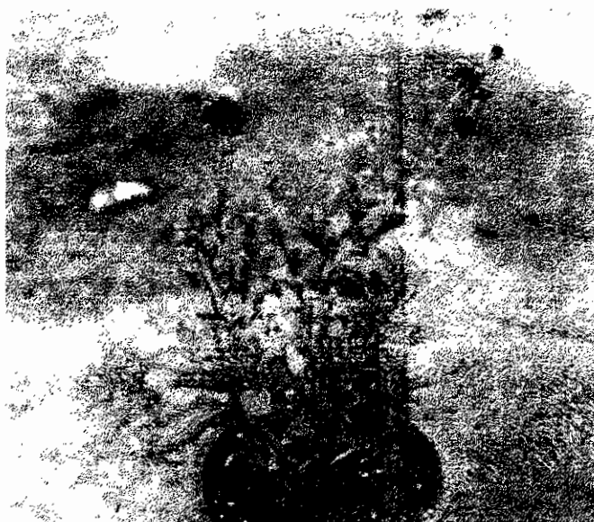
Fig (5): Flowering plant obtained from in vitro regeneration.

In conclusion, this study was developed as a protocol for rapid direct regeneration of Calendula officinalis from leaf and cotyledonary node explants. The efficiency of morphogenesis was dependent on growth regulators. Auxins (2,4-D or NAA) alone were essential to enhance shoot-bud regeneration from leaf culture, while BA was not effective in this concern. This protocol might be useful for genetic improvement programs of this plant.