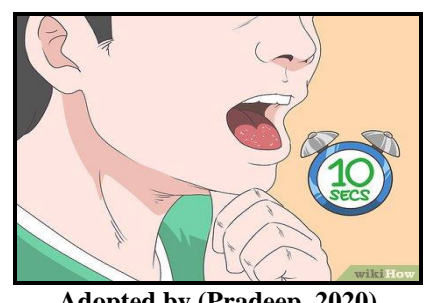
Adopted by (<u>Pradeep</u>, 2020)