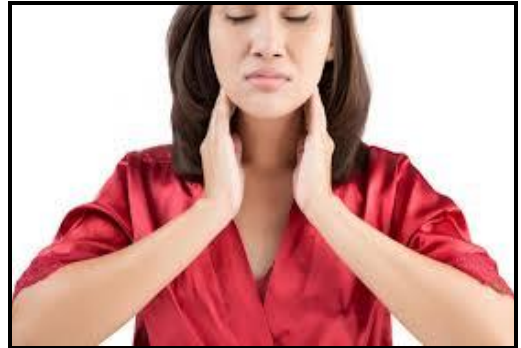
Adopted by (Change, 2021)