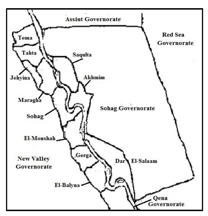
Figure (1): A map Showing the study area (Akhmim and Gehyena districts) at Sohag governorate, Egypt.