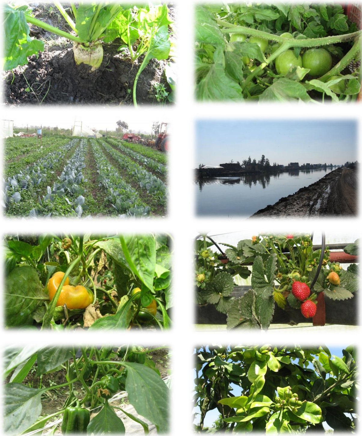
Fig. 1. The agriculture sector is very important source for our life to supply with the necessary foods, feed for our animals, fiber and fuel. The pictures are presenting different sectors in the agriculture including sector of vegetables, fruits, and agricultural drainage water. All photos were taken by El-Ramady from the experimental farming, faculty of agriculture, Kafrelsheikh university and El-Hamoul City, and Kitchener drain. All photos by El-Ramady.