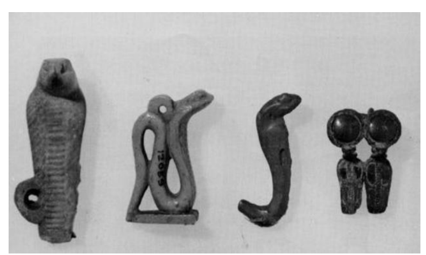
Fig.26 , The four defensive forms of the uraeui named with the serpent goddesses who appear the amuletic form. After, Andrews, C.,1994, Amulets of Ancient Egypt , London, 35.

inhabitants of the underworld.<sup>46</sup> It is alternatively seen (in the same community) as benevolent creator and protector of wisdom and eternal life, or perpetrator of evil and agent of death.<sup>47</sup>