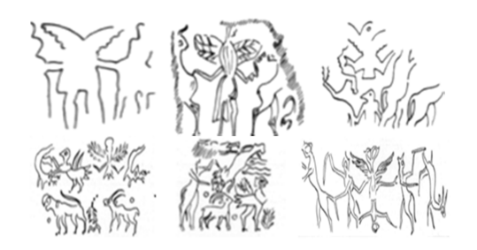
(Fig12)Amiet, L'Homme-oiseau, figs 1,2,3,4,6,7