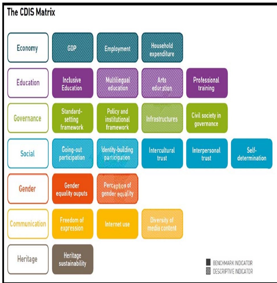
Figure (2): The CDIS Matrix (Source: UNESCO Culture for Development Indicators: Methodology Manual, 2014, p. 13).