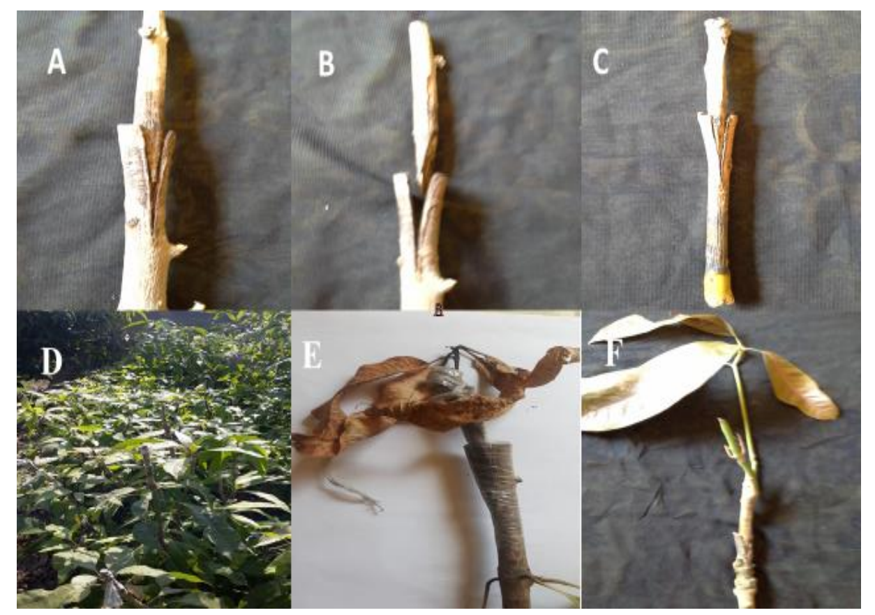
Fig. (2): Grafting failure (GF) symptoms appear on permutations and combinations of rootstock/scion as complete separation occurred between the scion and the rootstock on joined grafting area (A and B), this region turned into a brown and black, death of scion and dieback progress appeared on rootstock (C, D and E), compared with successful grafting (F).

failure, necrosis appeared on the scions and dieback appeared on the rootstock (Fig. 2). Data in Table (2) indicate that the highest means of incidence (%) of (GF) on all examined mango combinations permutations and of rootstock/scion were recorded in El Manashy nursery, Giza governorate (33.88 and 30.55%) during 2019 and 2020 respectively, followed by El Qanater nursery, Qalyoubiya governorate (27.78 and 23.33%). While the lowest means of incidence (%) of (GF) was recorded in Ismailia nursery, Ismailia governorate, being 22.22 and19.44% during the two grafting seasons, respectively. Regarding to the susceptibility of permutations combinations and of rootstock/scion to grafting failure, the maximum values of disease incidence in the three nurseries during the two years were recorded on Zebda/Kiett, Zebda/Sedeek and Baladyy/Kiett, followed by Balady/Sedeek, Sokkary/Kiett and Zebda/Ewais. On the other hand, the lowest susceptible rootstocks/scions were Sokkary/Sedeek, Balady/Ewais and Sokkary/Ewais.