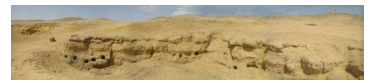
Fig.1: General view of the rock hill with holes cut in the rock

cm) containing an Osirian statuette of clay and wheat wrapped with bandages. They sometimes still have the remains of an erect phallus; however, they are mostly lost.<sup>1</sup>