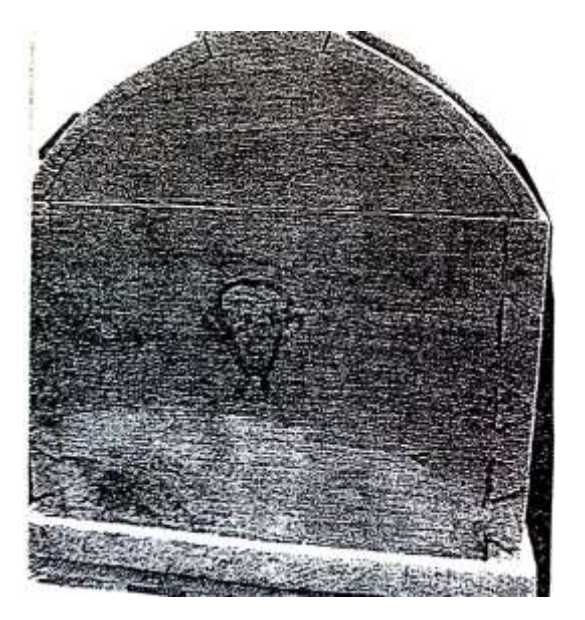
The sign h r on one side of the coffin, After Amal Samuel, fig. 72