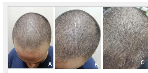
Fig 4: Male patient, 36 years old, with cicatricial alopecia of the scalp showing excellent improvement after 6 months of nanofat injection and hair transplantation. A and B. Before, C. After treatment