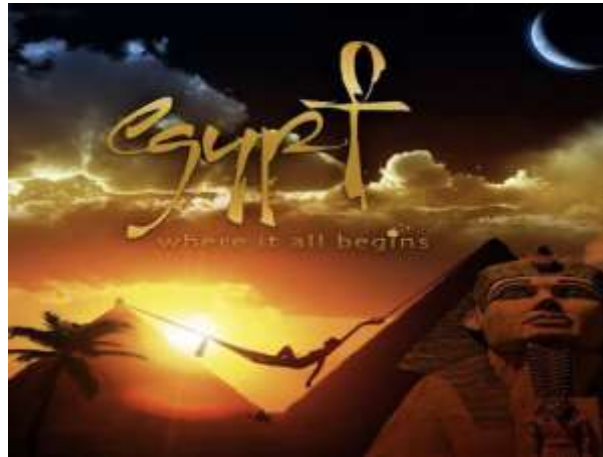
Figure (2-11) a picture of a recent tourist advertisement https://vimeo.com/11894676 accessed at 6/8/2019,5.37pm