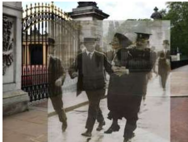
Figure (2-19) shows the use of augmented reality technology in front of Buckingham Palace in England http://www.tourismupdate.co.za/article/187273/Augmented-reality-gaming-fuels-innovative-tourism-experiences accessed at 6/8/2019, 6.13 pm