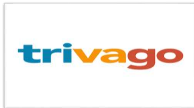
Figure (2-6) Trivago . Application https://ar.trivago.com/en?sLanguageLocale=UK accessed at 6/8/2019at 5.24pm

Tour companies have begun to use advertisements that provide images and information with video clips of the city or coast, temperature control, meal prices, and the quality of wearable clothing. Also, some companies have shown tourist films showing scenes of different sites of hotels and the coasts overlooking them, where the tourist chooses the important sites he wants to see and enjoy their waters, for example the Trivago application.