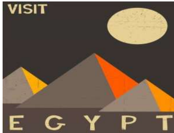
Figure (2-7) is a picture of the” visit Egypt “advertisement https://www.pinterest.visitegypt.com accessed at 6/8/2019 5.17 pm