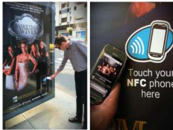
Figure (2-12) Interactive road advertisement via mobile phone (www. Clearchanneloutdoor.com. accessed at 6/8/2019, 5.38 pm)