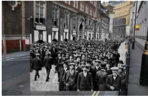
Figure (2-18) illustrates the use of augmented reality technology 10 Downing Street in England http://www.tourismupdate.co.za/article/187273/Augmented-reality-gaming-fuels-innovative-tourism-experiences accessed at 6/8/2019, 6.12 pm