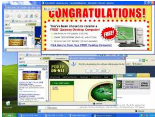
Figure (2-9) Pop-up's windows

https://www.engadget.com/2014/08/14/the-creator-of-the-pop-up-ad-