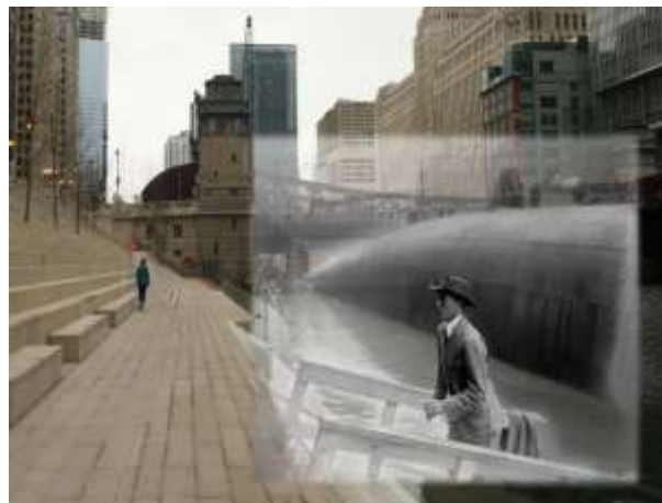
Figure (2-17) shows the use of augmented reality technology in front of the River Thames in England

https://mashable.com/2011/06/06/virtual-air-rights-augmented-