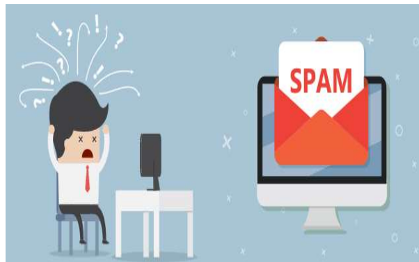
Figure (2-8) E-mail spam.

There is great confusion due to the presence of the advertisement within a large framework between information and advertisements, which may not achieve the desired goal of the advertisement, as well as some advertisements that are sent directly to the public and cause great boredom to the recipient, which is the so-called E-mail spam.