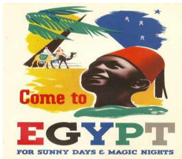
Figure (2-10) of an old tourist advertisement image https://www.pinterest.com/pin/130182245448158702/ accessed at