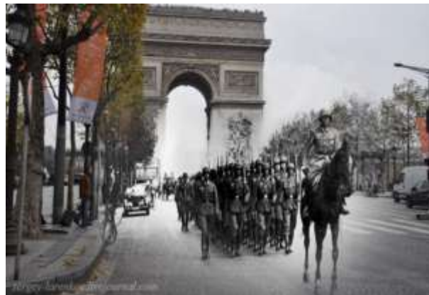
Figure (2-15) shows the use of augmented reality technology in the Arc de Triomphe in France

The following are examples of some streets and tourist buildings in different regions of the world that rely on augmented reality technology for tourism advertising.