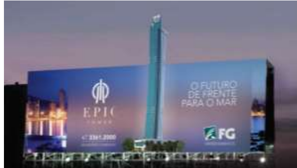
Figure (2-13) Road advertisements on giant television screens https://aqualiteoutdoor.com/big-screen-led-signs-billboards/ accessed