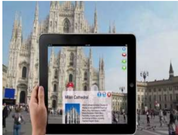
Figure (2-16) shows the use of augmented reality technology in Milan Cathedral, Italy

https://thinkmobiles.com/blog/augmented-reality-tourism/ accessed at