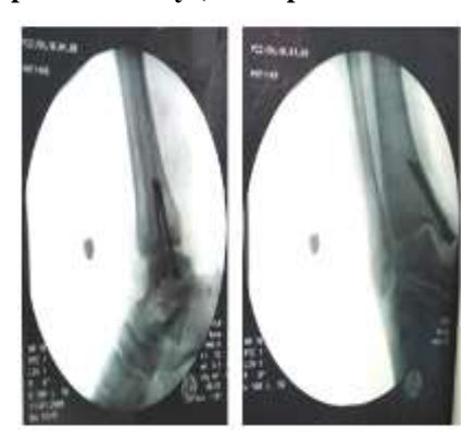
Fig. (6)Immediate postoperative X.ray (anteroposterior & lateral views)