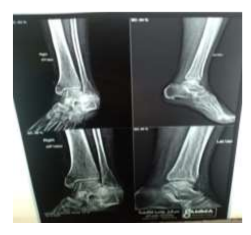
Fig (8)Preoperative x.ray (anteroposterior &lateral)