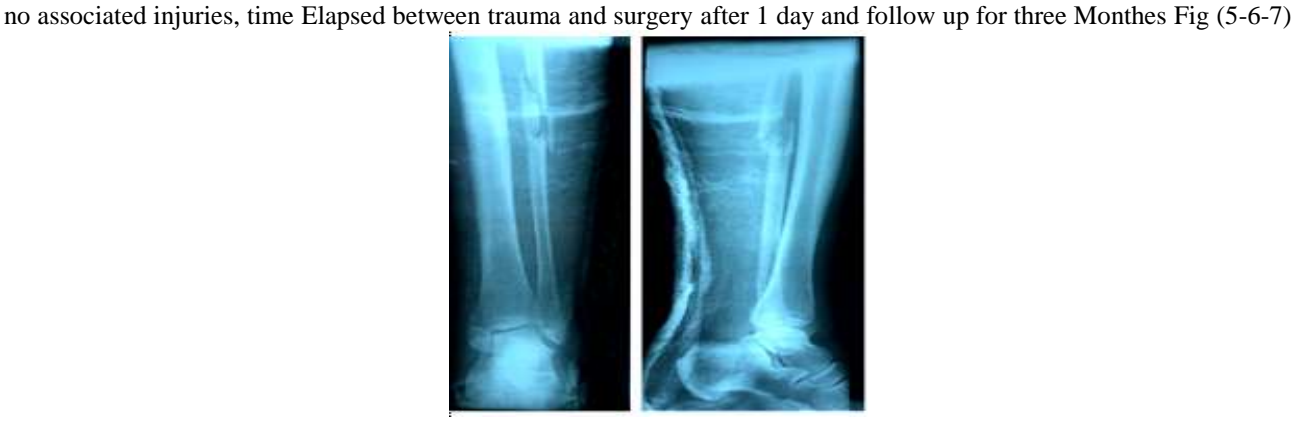
Fig. (5)Preoperative X.ray (anteroposterior and lateral view)

5.Case Presentation Case 1 <u>A.History:</u> Male patient 34 years old and Mode of trauma: ankle twisting injury <u>B.Preoperative evaluation:</u> Fracture type: medial malleolus fracture, Side affected: The left side, concomitant diseases: no history of medical illness,