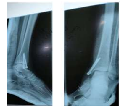
Fig. (7)3months follow up

Fig. (6)Immediate postoperative X.ray (anteroposterior & lateral views)