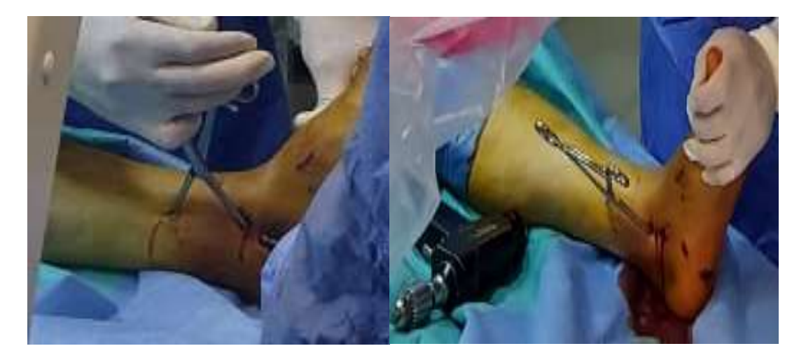
Fig.(4) Percutaneous approach in the treatment of medial malleolar fracture.

Fig.(3) Closed reduction through percutaneous technique and imaging to check adequate reduction intra-operatively.