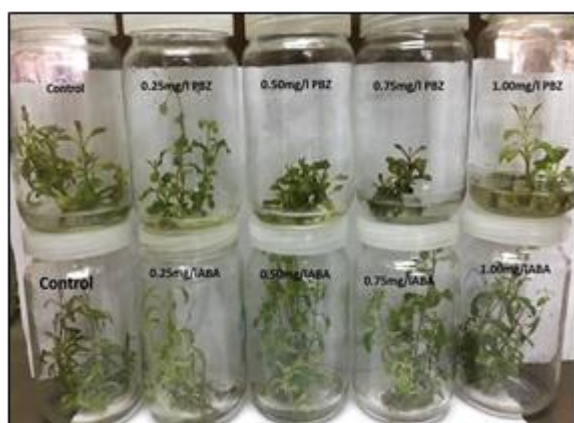
Fig. (4): Conservation of stevia on growth retardants after three months.