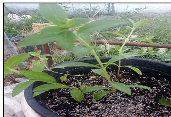
Fig. (3): Development of stevia in greenhouse after two months.