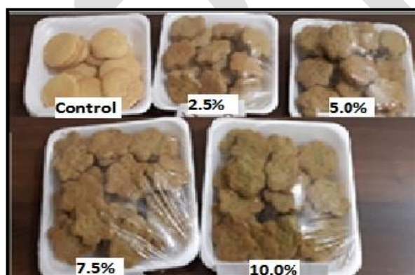
Fig. (5): Biscuits prepared with different levels of Stevia extract.