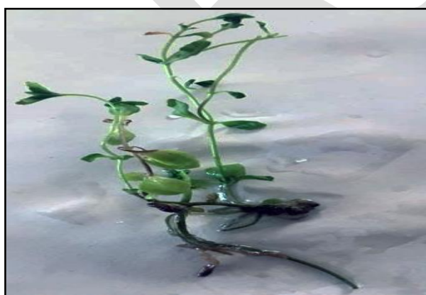
Fig. (2): In vitro induction and development stevia roots on MS medium supplemented with 2mg/l IBA.