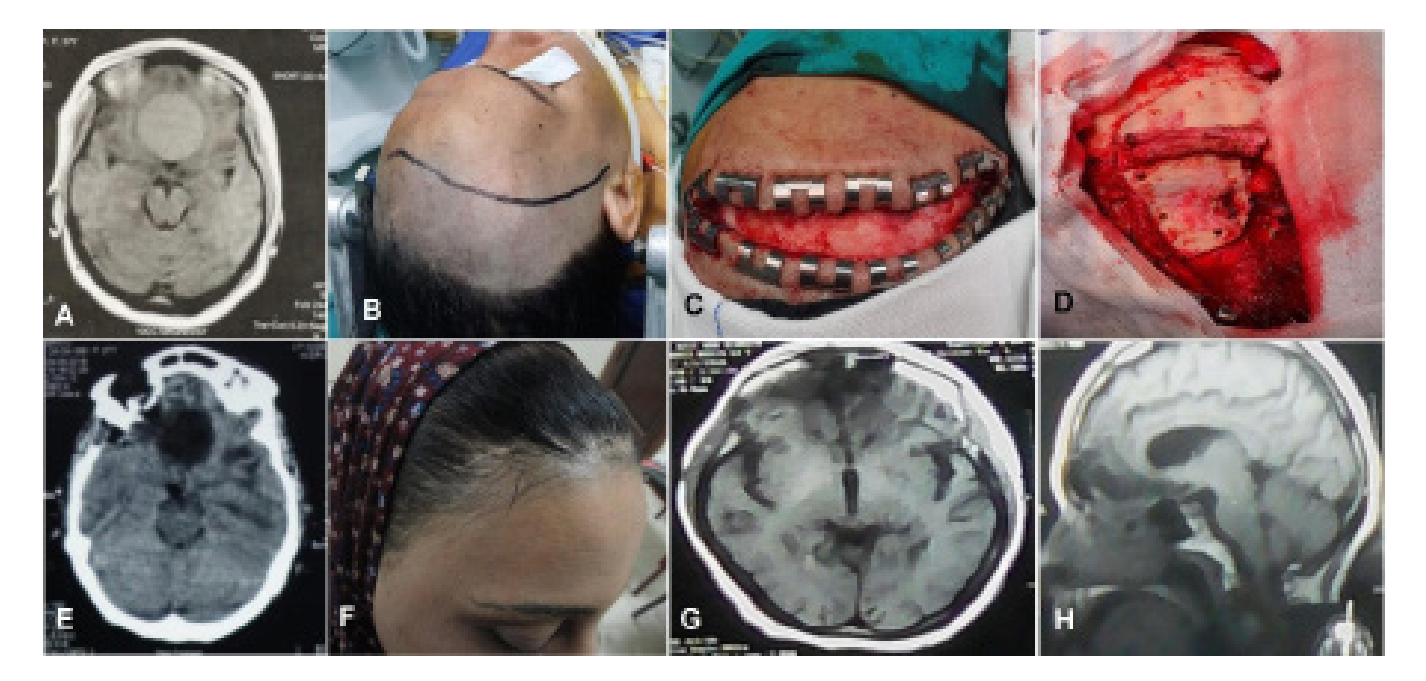
Fig 1: The pterional approach. (A) T1 MRI axial view with contrast, showing olfactory groove space occupying lesion (SOL). (B) Intraoperative image showing line of classic right fronto- temporal skin incision. (C) Intraoperative image showing skin and subgaleal dissection. (D) Intraoperative image showing boundaries of bony flap craniotomy. (E) Early Postoperative CT scan showing complete excision of the tumor with jet black dense tumor bed. (F) Postoperative image showing incision scar behind the hair line. (G) Postoperative T1 axial MR showing complete excision of the tumor. (H) Postoperative T1 sagittal MR showing complete excision of the tumor.

The patient was placed in the supine position, the head was fixated using a Mayfield head holder, and it was