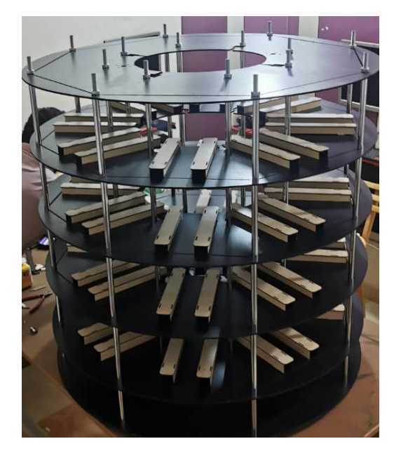
Fig.2 implementation on ground

5<sup>th</sup> IUGRC International Undergraduate Research Conference, Military Technical College, Cairo, Egypt, Aug 9<sup>th</sup> – Aug 12<sup>st</sup>, 2021.