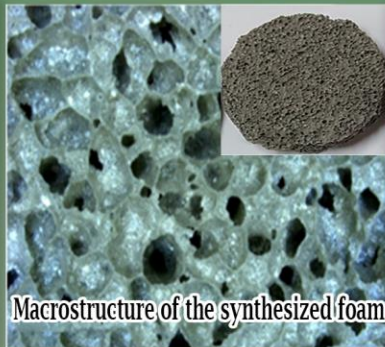
Macrostructure of the synthesized foam