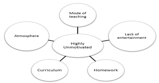
Figure 1. Reasons for poor motivation Second question

To sum up the teacher's and students' point of view reveals that students are largely unmotivated for several reasons as can be viewed clearly below: