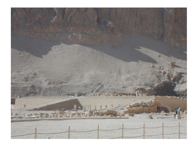
Fig.1. Montohotep II Temple in El Deir El Bahari