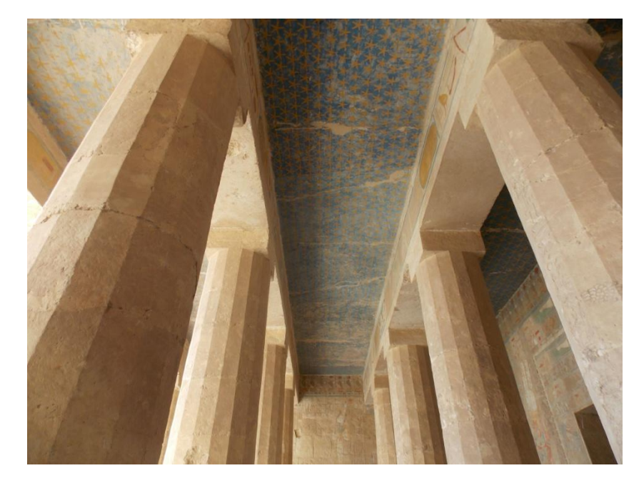
Fig.3. Anubis Chapel, Hatschepsut Temple