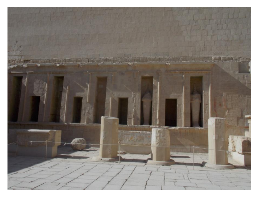
Fig.7. Third Terrace, Hatschepsut Temple