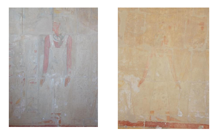
(a) (b) Fig.4. a,b. Queen Ahmose, Hatschepsut Temple