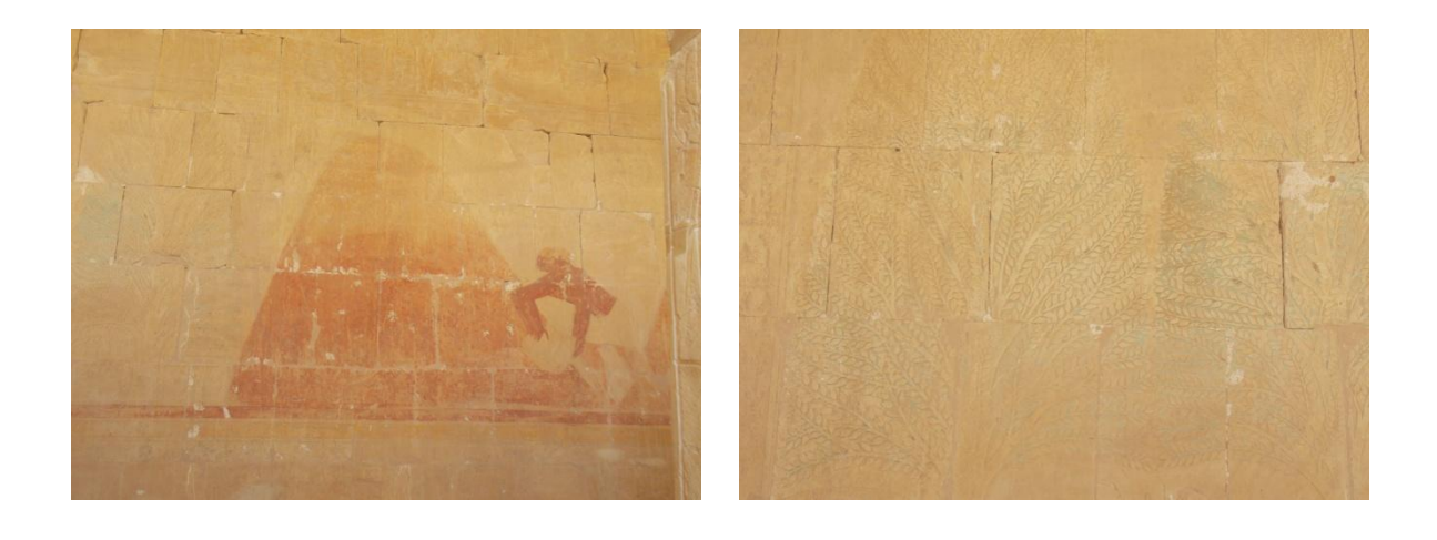
(a) (b) Fig.5. a,b. Punt Hall, Hatschepsut Temple © Eman Badawy