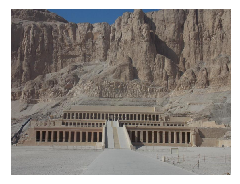
Fig.2. Hatschepsut Temple in El Deir El Bahari