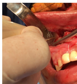
Figure(1) osteotomy cut using peizotome .

Recorded data were statistically analyzed using the package for social sciences, SPSS 20.0 (SPSS Inc., Chicago, Illinois, USA). Quantitative data were expressed as mean± standard deviation (SD). Qualitative variables were expressed as count (n) and percent (%). The confidence interval was set to 95% and the margin of error accepted was set to 5%.