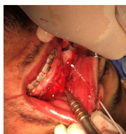
Figure (2) osteotomy cut using surgical saw .