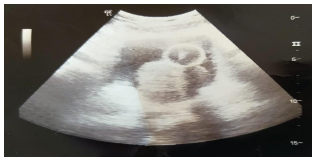
Figure 1: ultrasound image shows a 65-gram prostate with median lobe

on xanthogranulomatous prostatitis, with no histological sign of malignancy (Figure 2). After six months of follow-up, the patient still has no symptoms. His serum PSA decreased to 5 ng/ml.