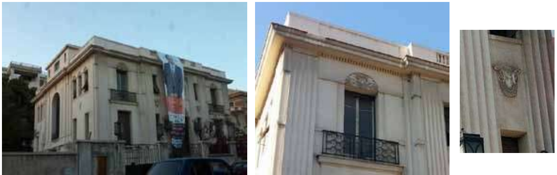
Fig.13 : Ornamental details of an Art Deco Style villa facades, with a mix of different styles; vertical pilasters with shallow volutes and a minimal capital, accentuates gracefulness of lines, semicircular panels over windows and doors with decorative bas relief ornaments of gargoyles heads and geometric repeated patterns of foliage like motifs, dentil ornament surrounding the top, gargoyles heads symbolizing guardians, forged iron (fer forge) balcony grills with scroll patterns, classical balustrades on parts of the parapet. (Soliman Yousri St.- Latin District)