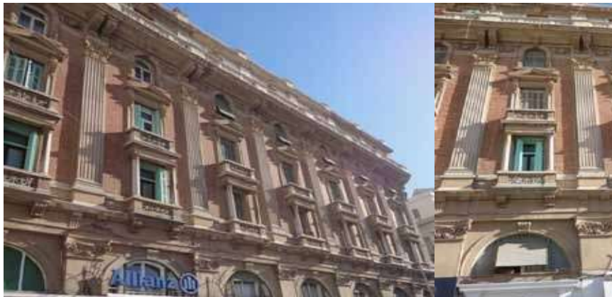
Fig.1 : Ornamental details of a Neo classic style residential/offices building façade; first level with plain shafts pedestals with ionic capitals and decorative motifs of shells and leaves, Diocletian windows with classical scroll form key stone, second level; fluted shafts pedestals with composite capitals with acanthus leaves decorative motifs, Tuscan columns on third floor balconies, with Greek geometric pattern, triangular pediment over windows, Voluted brackets, top frieze with dentils, sculptured birds and garlands. (Fouad St.)

CASE STUDIES; Figures (1 to 16) illustrates the main features and characteristics of ornaments and motifs found on facades of heritage buildings in downtown districts of Alexandria;