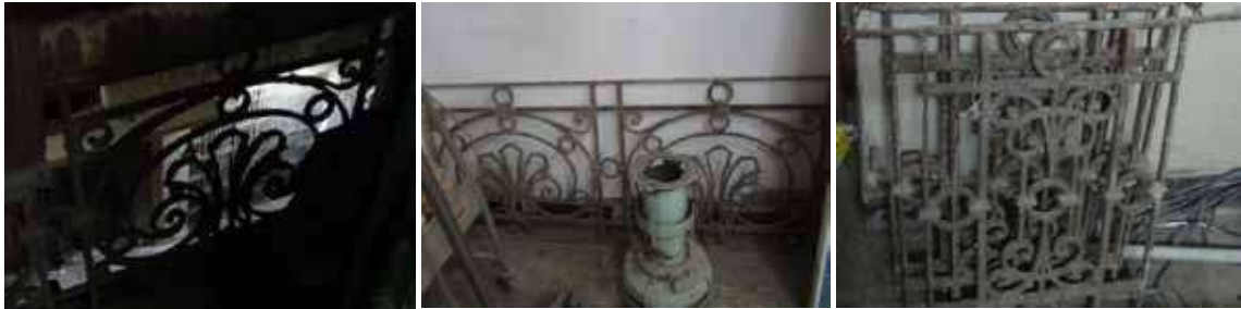
Fig. 12: Ornamental detail of forged iron (fer forge) balcony grills with scrolls, circular and anthemion leaf patterns, wide spread classical rhythmical repetition of classical motifs. (Residential building in Fouad St.)