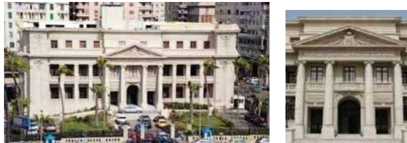
Fig.7 : Ornamental details of a Greek Revival Style villa; the main entrance accentuated with triangular pediment and entablature with classical motifs, a metope and triglyph frieze also dentils, four Ionic columns with pedestals, walls with stone effect, Greek geometric patterned balcony grills, side broken pediments centered with circular wreath with laurel leaves. (Raml District, Cournich Road) (villa now: Women public service center)