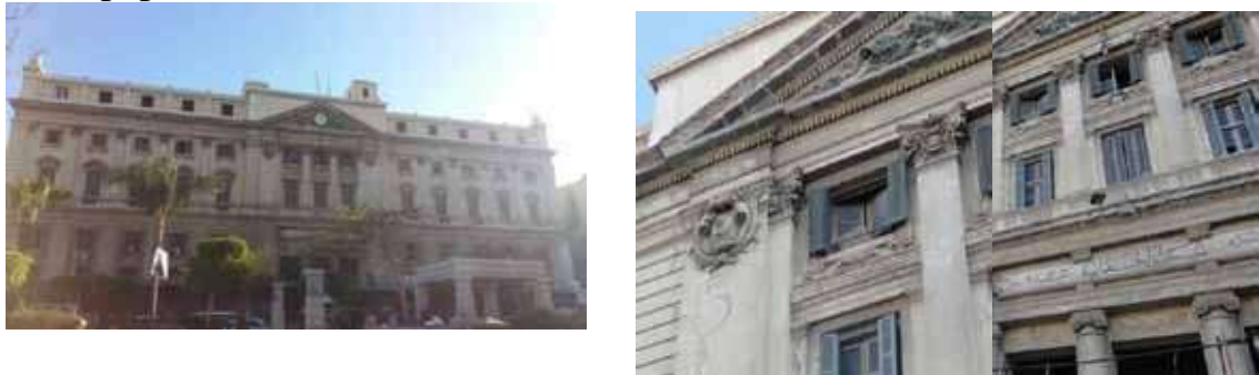
Fig. 3 : Ornamental details of a Neo classic style court house; symmetrical façade with triangular pediment containing classical motifs of foliage, plain shaft Ionic columns with voluted capitals with egg and dart motifs, composite pedestals, third storey level windows have a pediment, stone effect walls, classical balcony balustrades. (Manshieh square District)