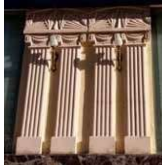
Fig. 14: Ornamental details of Art Deco Style residential building façade; the ground level has distinctive decorative sets of pilasters with a rectangular base and capitals of volutes and festoons, with a geometric radiating ornamental plate above it. (Fouad St.)