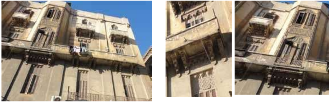
Fig. 4: Ornamental details of a Neo Islamic residential building with traditional elements of Islamic ornaments; Stalactites and brackets beneath balconies, panels with geometric and arabesque patterns of floral and foliage abstract forms. (Manshia District)