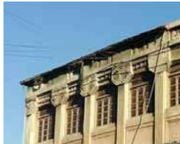
Fig. 15 : Ornamental details of an Art Deco Style building facade, with an arcade of Greek influenced fluted pilasters with capitals of volutes and anthemion leaf, an entablature with an abstract of metope and triglyph, defining the principle of recurrence and rhythm. (Soliman Yousri St.- Latin District)