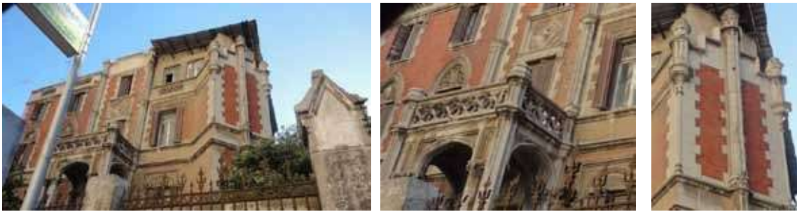
Fig. 9: Ornamental details of a Gothic revival style villa facade; with a porch of gothic columns, vertical gothic pilasters, gothic pointed transom over the entrance, a label around windows, balconies grills and parapet with gothic ornaments, quoins on corner sides, rectangular and flattened pointed arches panels with gothic bas relief motifs, urns on top edges. (Latin District)