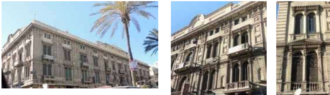
Fig. 5: Ornamental details of an Eclectic Style residential building; with a mix of different styles; classic renaissance windows some with triangular pediment and others with lintel frieze cornice, panels with geometric forms, the main frieze with volute scrolls, walls embellished with stone effect, classical balcony balustrades. (Manshia square District)