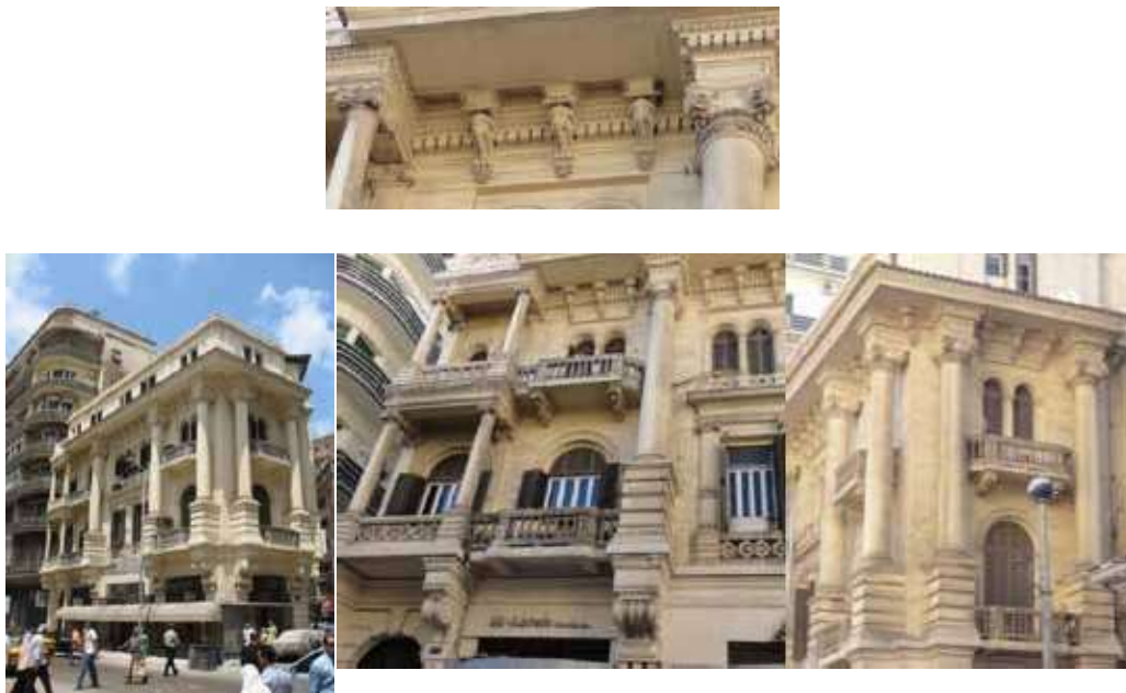
Fig. 2 : Ornamental details of a High Eclectic Mannerist building; with a mix of different styles; plain shaft Ionic columns and pilasters, egg and dart motifs resembling life and death, cornice with dentils, variety of bracket ornaments some with animals heads and some with acanthus leaves others with voluted form, balcony balustrades with columns and scroll motifs, stone effect walls. (Fouad St.) (Palazzina Agion,6881 ) (Now a branch of AlAhram Newspaper)