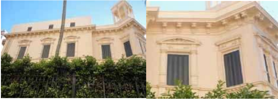
Fig. 8 : Ornamental details of a Neoclassic style villa facade; where windows surrounded with ionic capitals pilasters and raised panels topped with an arched pediment with scrolling foliage, cornice with repeated voluted brackets, stone like wall finishing. (Latin District)