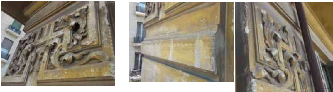
Fig.11: Close up ornamental stucco bas relief detail of classical influenced building facade frieze with foliage embraced into Greek Key decorative border identifying infinity and unity. (Residential building in Fouad St.)