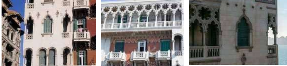
Fig. 6: Ornamental detail of Venetian Gothic Style residential building “Little Venice”; repeated pointed cinquefoil arches, rosettes and arcade of columns, various window types some with flattened pointed arch, some with trefoil arch and others are rectangular, parts of facades with stone effect or walls rich patterns, panels of multicolored decorative brick stones. (Raml District, Cournich Road)