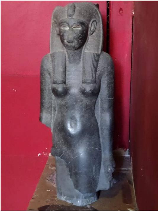
FIG.1. a. Cairo JE 65442, Royal Woman Torso © Sameh