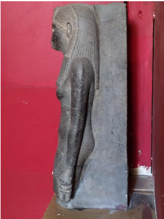
FIG.1. c. Cairo JE 65442 Royal Woman Torso