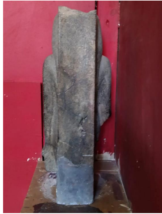
FIG.1.b Cairo JE 65442, Royal Woman Torso