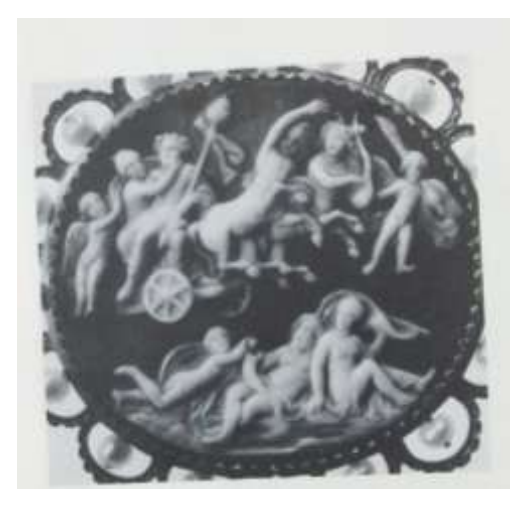
FIG. 3: Cameo, from France, National Bibliotheque of France, Hellenistic Period, the end of 1<sup>st</sup> century BC. Babylon, Camees antiques, 46, no. 79, pl. IX.