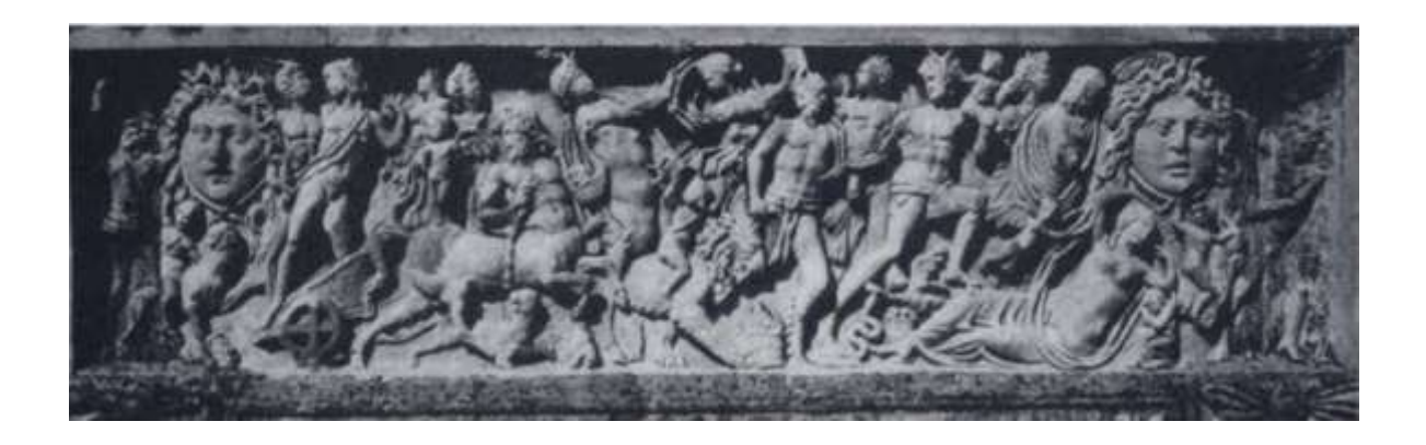
FIG. 8: Roman Sarcophagus, The Triumph of Bacchus, kept in Casino Rospigliosi, Rome, 150 AD. Matz, Die Dionysischen Sarkophage, Tafel 69.1; Meadows-Rogers, "Procession and Return", fig. 6.

FIG. 7: Roman Marble Sarcophagus in Cambridge, Fitzwilliam Museum, Inv. GR. 1.1835. 150 AD. Matz, "Die dionysischen Sarkophage", no. 129; LIMC, 469.