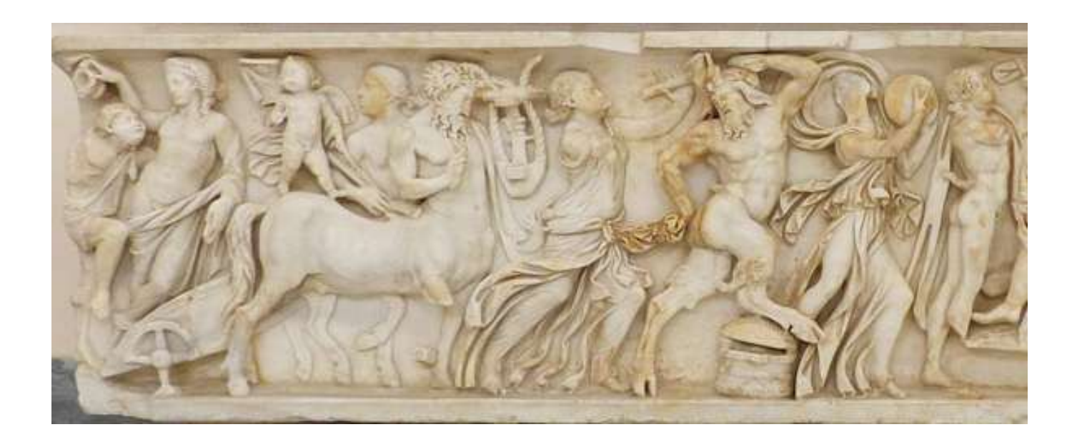
FIG. 6: A Marble sarcophagus, National Archaeological Museum, Naples. Inv. No. 6693 dates back to 160-170 AD.