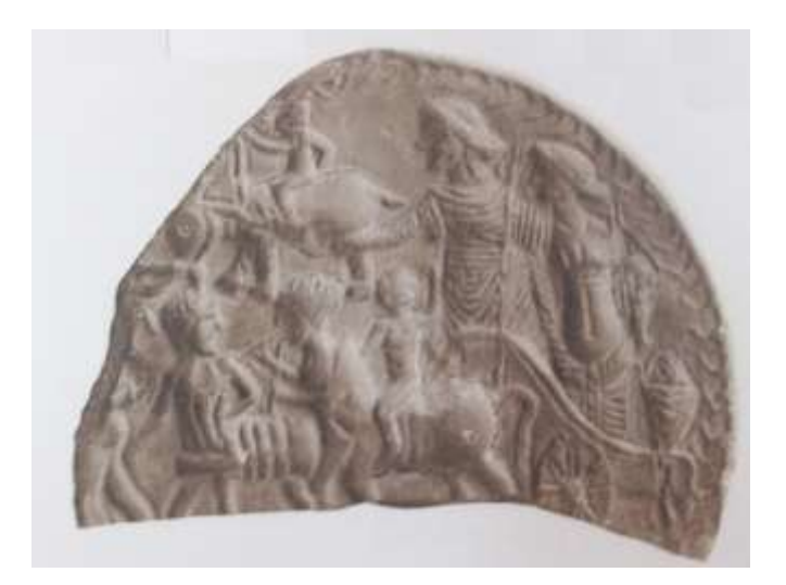
FIG . 4: Bread stamp, Fouquet Collection, Ptolemaic Period. Perdrizet , les terres cuites grecques, p. 83 , pl. LXVII , no . 198

FIG. 3: Cameo, from France, National Bibliotheque of France, Hellenistic Period, the end of 1<sup>st</sup> century BC. Babylon, Camees antiques, 46, no. 79, pl. IX.