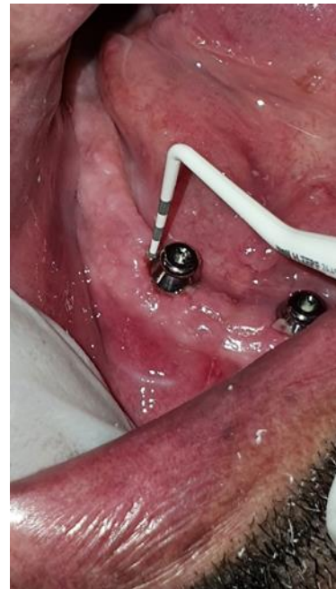
Figure 1: Measurement of marginal bone loss distally