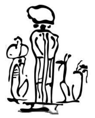
Fig. 1: Facsimile of the royal name on the mummy wrapping Cairo SR 2201

The central section of this depiction probably shows the cryptographic writing of a royal name that consists of the following elements: