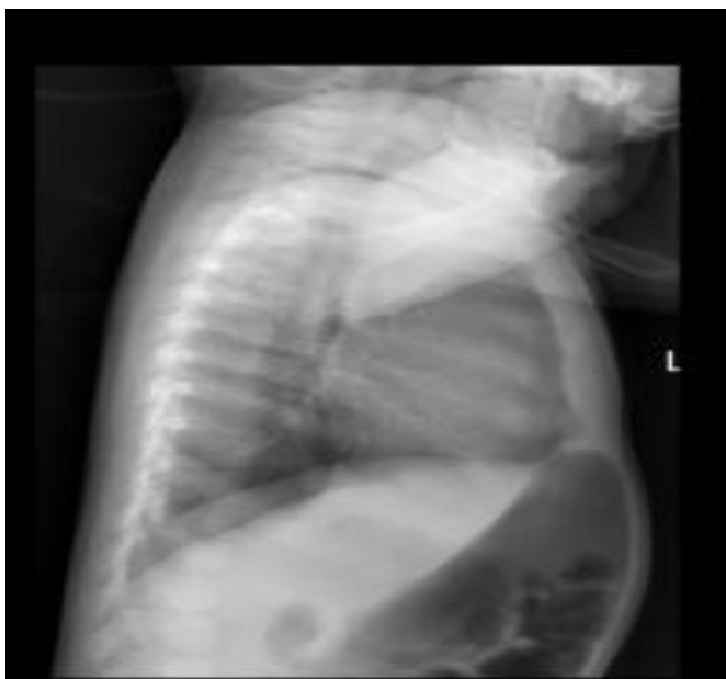
Fig. (2): Normal lung field, dilated bowel in the left side, no pneumothorax.