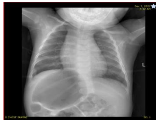
Fig. (1): Normal lung field bilaterally, dilated bowel in the left side, no pneumothorax.

Our patient is a 5 months old baby girl product of full-term pregnancy by spontaneous vaginal delivery (SVD) at another hospital, she had unremarkable antenatal history and normal pregnancy and maternal history, following her birth she was immediately admitted to neonatal intensive care unit (NICU) due to decreased oxygen saturation where she stayed in for 4 days on supportive therapy and did not require ventilation, she was discharged in stable condition by the end of 4 th day.