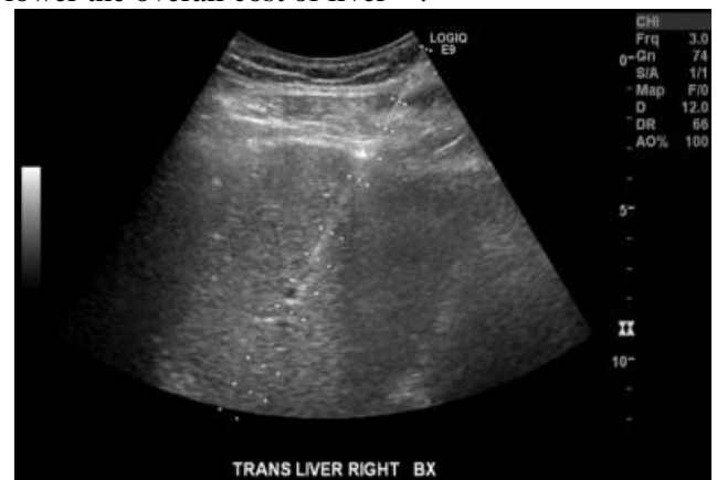
Figure (1): In the examination of a patient with known hepatitis C through a subcostal route, an ultrasound image shows real-time percutaneous needle placement for a random liver biopsy (5) .

liver fibrosis, which is marked by "irreversible" anatomic and hemodynamic changes. As a result, early detection of hepatic fibrosis is critical for initiating therapy on time and efficiently achieving disease regression (3) . Percutaneous liver biopsy is a painless treatment that can be done in the office. Imaging guidance is becoming more common, and it has a number of benefits over palpation- or percussion-guided procedures, including a lower complication rate and a higher diagnostic yield. Because of its low cost, real-time guidance, multiplanar imaging, portability, visualization and avoidance of major blood vessels and lung, and lack of ionizing radiation, ultrasound is the chosen imaging modality in most instances. The use of ultrasound for imaging guiding has also been proven to reduce the number of severe and minor problems. Although ultrasound-guided liver biopsies are slightly more expensive per procedure than palpation-guided biopsies, cost-effectiveness studies have revealed that the various advantages of ultrasound guidance may lower the overall cost of liver (4) .