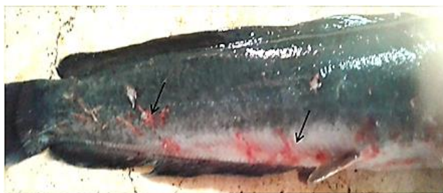
Figure (2): Catfish showing hemorrhage on body surface and ulceration of the skin