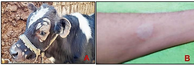
Fig. 1. Affected calf showed typical circumscribed crusty lesions in head region (A) erythematous circular scaly lesions with advancing edges in the arm area of the infected farm workers in the current study (B).

The high prevalence rates of infection in the examined farm might be attributed to climatic condition, poor hygienic measures, and faulty housing system where calves housed in close contact to each other for long periods without sun light exposure. Winter season that is characterized by cold temperatures and high humidity rates play a role in the maintenance and existence of spores in the surrounding environment and the soil (Radostits et al., 1997). Moreover, Ringworm caused by T. verrucosum is characterized by rapidly spreading among susceptible animals. The prevalence rate (35%) observed in this study is consistent with other reports from Egypt, 30% (Abd-Elmegeed et al., 2015), 12% (EL-Ashmawy et al., 2015) and 12.5% (Mousa and Abdeen, 2018). On the other hand, Aboueisha and El-Mahallawy (2013) denoted higher detection rates than the current study (61.9%). In Nigeria, 13% prevalence of ringworm was reported by Dalis et al., (2019). However, low prevalence rate (3.75%) was documented in Afghanistan by Langar et al., (2020). Variation in the prevalence of the disease among countries is possibly attributed to climatic conditions, housing system, animal breed and production.