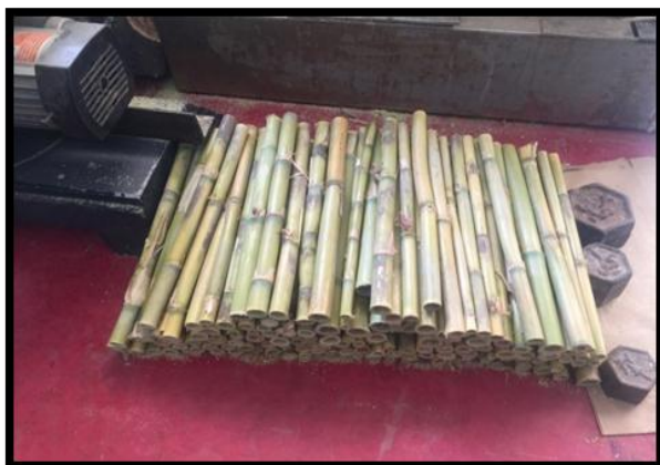
Photo.1. Reed stalks