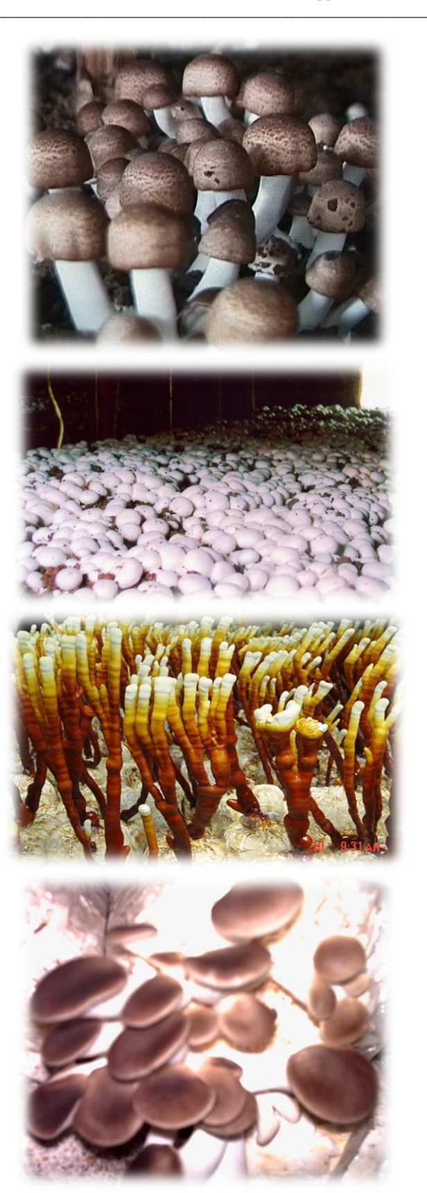
Almond mushroom: Agaricusblazei Scientific name: Agaricusblazei Murrill (1945) Kingdom: Fungi Phylum: Ascomycota Class: Dothideomycetes Order: Agaricales Family: Agaricaceae Genus: Agaricus Linnaeus, 1753 Applications: - Edible food - Alternative medicine - It is supposed anti-cancer effect

Cultivated Mushroom: Agaricusbisporus Sci name: A. bisporus (J.E. Lange) Imbach (1946) Kingdom: Fungi Phylum: Ascomycota Class: Dothideomycetes Order: Agaricales Family: Agaricaceae Genus: Agaricus Linnaeus, 1753 Applications: - Nutraceutical activities - Production of chitin nano-paper