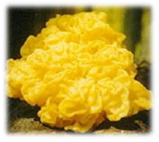
Egypt. J. Soil Sci. 62, No. 2 (2022)