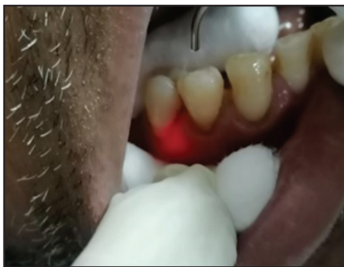
Figure (1): Clinical photograph showing laser beam application.

Diode laser with a wavelength 810 \pm 20 nm was used in photodynamic application. Laser beam at power of 0.6 W in a continuous mode was applied to the pocket parallel to the long axis of the tooth from apical to coronal direction with a 200mm tip diameter (Fig.1), for 30 seconds and stopped for 10 seconds (relaxation time). This process was repeated 4 times, with total time of 240 sec. Protective eyewear was worn to prevent injury from laser exposure and to comply with safety standards.