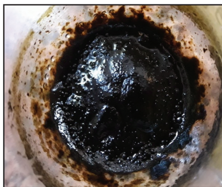
Figure (1): Ethanolic Miswak extract

Residual ethanol in the combined extract was evaporated and dried under reduced pressure in Rota vapor (Heidolph™ Hei-VAP Precision motor lift Rotary Evaporator, Germany) at 40°C till dryness. The extract (Fig.1) was kept in a closed glass container in the refrigerator until use. The extract was prepared in the National Institute of Research, Medicinal and aromatic plants research department, pharmaceutical and drug industries, Cairo, Egypt.