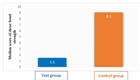
Figure (1): Bar graph representing median score for shear bond strength in group I hydrophilic sealant (test group) and group II hydrophobic sealant (control group).

Shear bond strength test result showed median 1.5 MPa in the hydrophilic sealant group however the hydrophobic sealant group demonstrated a median 9.1 MPa. The hydrophilic sealant showed lower significant median scores compared to hydrophobic sealant at P value ( p < 0.0021 ). table (2) fig (1) The most in common median failure mode was adhesive for hydrophilic sealant (63.6 %) (fig 3,5), on the other hand, the hydrophobic sealant group showed a higher median result of Mixed failure (72.7 %) (fig 4,6). However, the difference between both groups was non-significant with P value ( P = 0.19 ) in the failure mode table (3) fig (2)