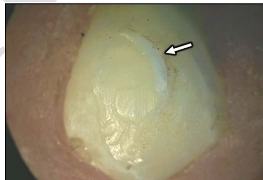
Fig. (6): Mixed mode of failure in group II hydrophobic sealant.