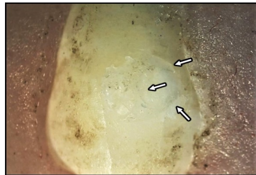
Fig. (4): Mixed mode of failure in group I hydrophilic sealant.