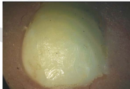
Fig. (5): Adhesive mode of failure in group II hydrophobic sealant.